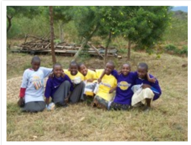
Girls with their Laker shirts and cameras