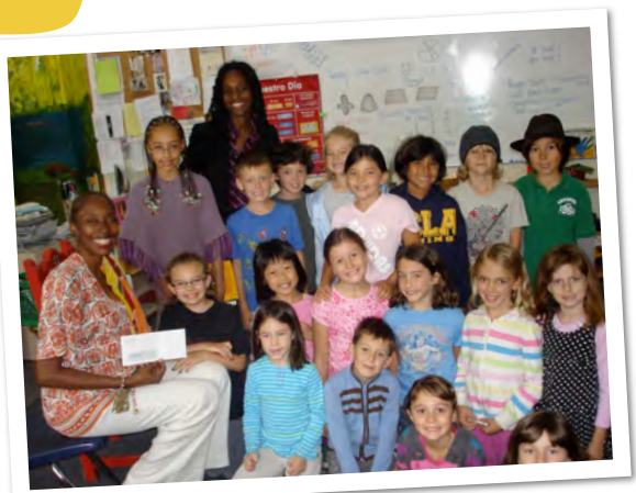
The Walden School - Receiving check 2009