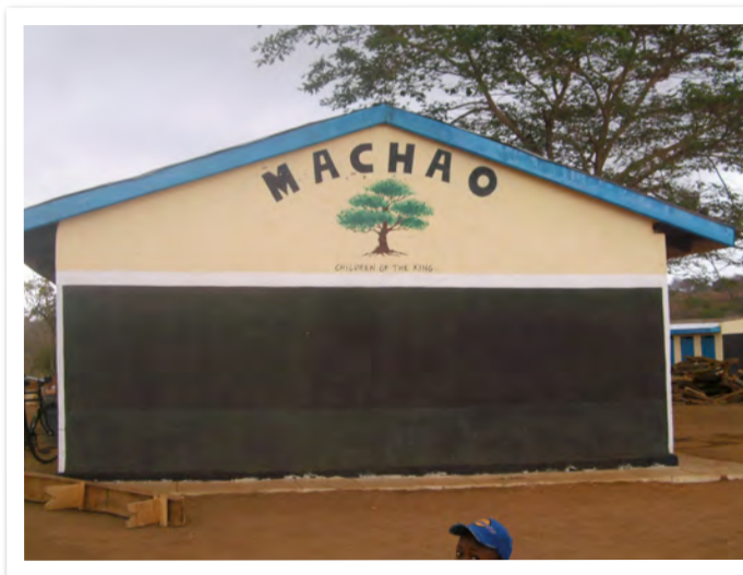
July 2009 (Artistic design created on the old orphanage building)

For those of you have already given to the Water Project - thank you and we have good news for you. But you must check out page 6 of this newsletter to find out what that is.